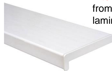
Internal windowsills from high quality laminated chipboard.