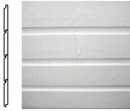
Exterior wall paneling.

For house facade we use a wood boards with finesawn surface. We mainly use a paint that have proven reliable in Nordic conditions from well known European suppliers, e.g. Teknos, Tikkurila.