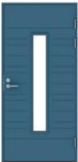
FUNCTION F186 W28