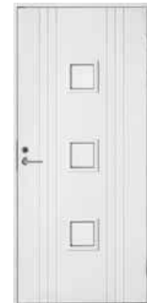
FUNCTION F2053 W83