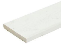
Exterior wall panelling and soffit boards.