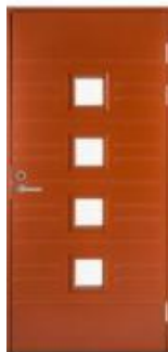
FUNCTION F1896 W84