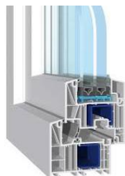
6-chambered frame, triple glazing