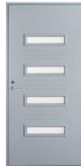
FUNCTION F2054 W53